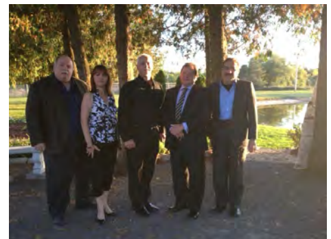
Windsor Delegates @ the Ottawa Annual General Meeting