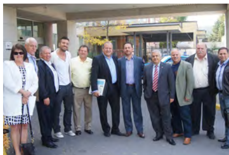
Delegates @ the Ottawa Annual General Meeting

As you can see Windsor Chapter represents the Executive committee well.