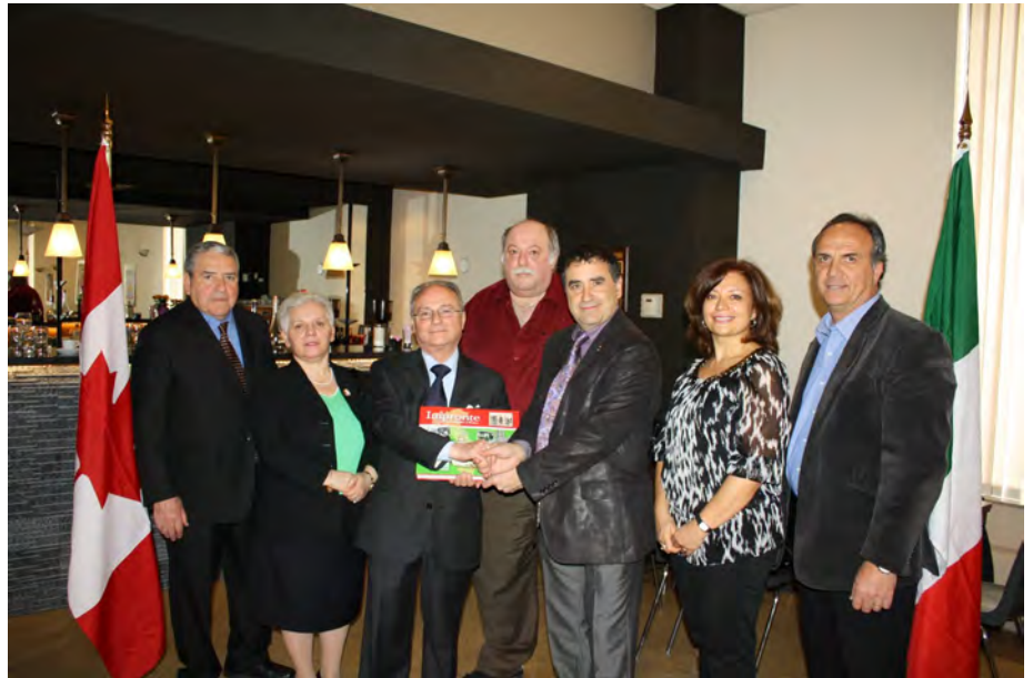
Tullio Guma -Il Console Generale d'Italia a Toronto - came to visit CIBPA Centre.