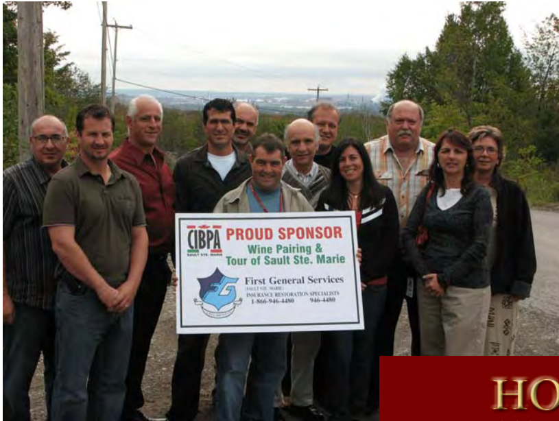
Delegation from Windsor, Toronto, Montreal, Sudbury, Thunder Bay & Ottawa