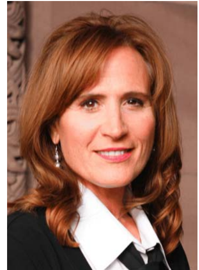
Community Service The Honourable Sandra Pupatello MPP Windsor-West